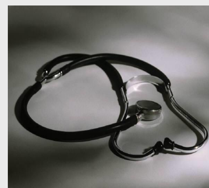
Figure 1. Label in 20pt Arial.